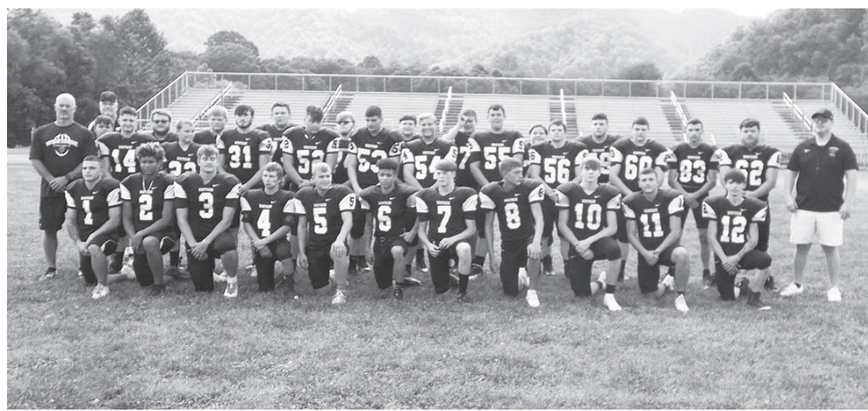
2021 WESTSIDE RENEGADES